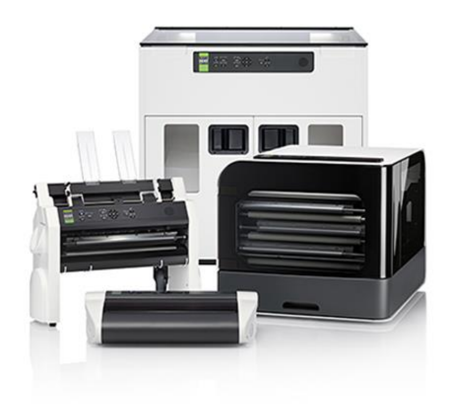
Braille printing made easy